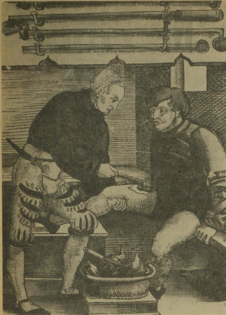
"Cautery" by Johannes Wechtlin (German, ca. 1490-1500)