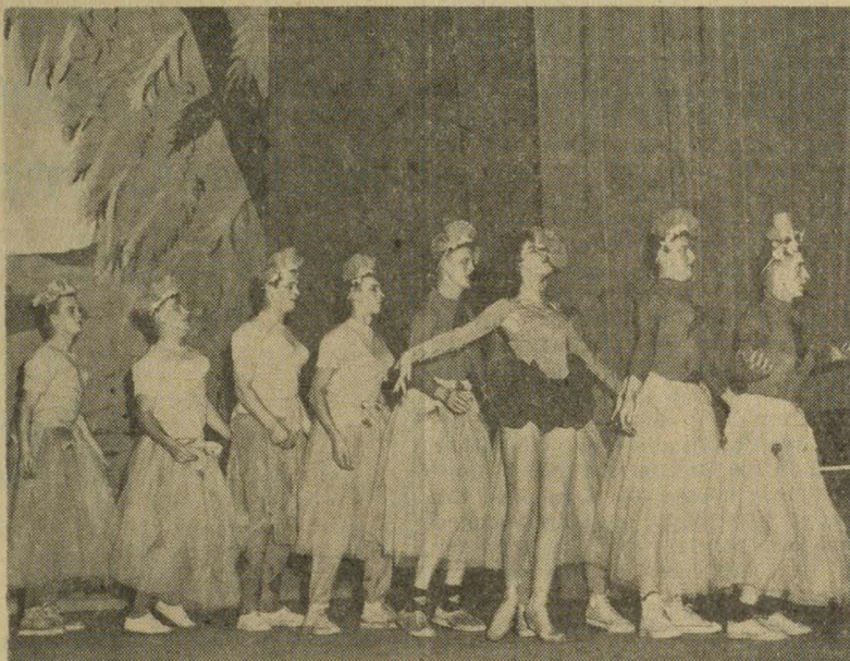
Phi Delta Theta's "Chorus Line"