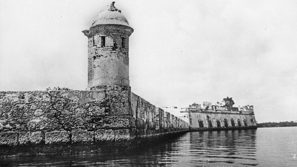
CORNER OF SAN FERNANDO CASTLE. (FORTIFICATION) , CARTAGENA-COLOMBIA