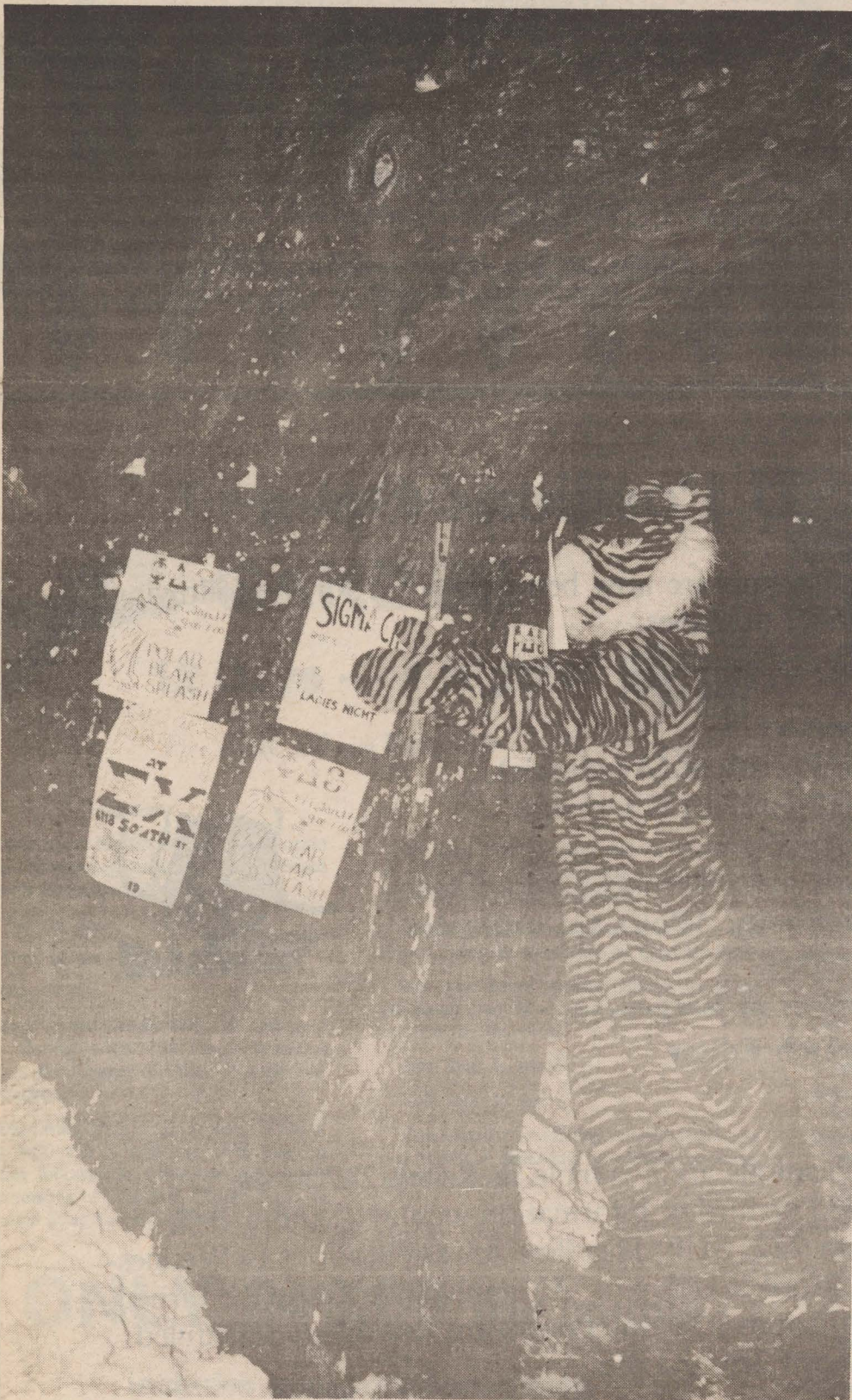
The Dal Tiger in his first TV show, "Tiger Tales".

Due to the overwhelming success of CKDU-FM's first year of broadcasting to the metro area, the Student Union has voted unanimously to allow funding for the creation of a Dalhousie-run television station. The cable companies have offered to help organize and carry the station. The CRTC has granted a temporary license for CKDU-TV to begin broadcasting 18 hours a day on Channel 14 this fall. Already plans for a television studio have been drawn up. The studios will be built on Studley Field, construction beginning within the next few weeks.