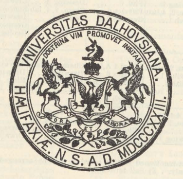
HALIFAX PRINTED FOR THE UNIVERSITY BY MCALPINE PUBLISHING CO., LTD-1912.