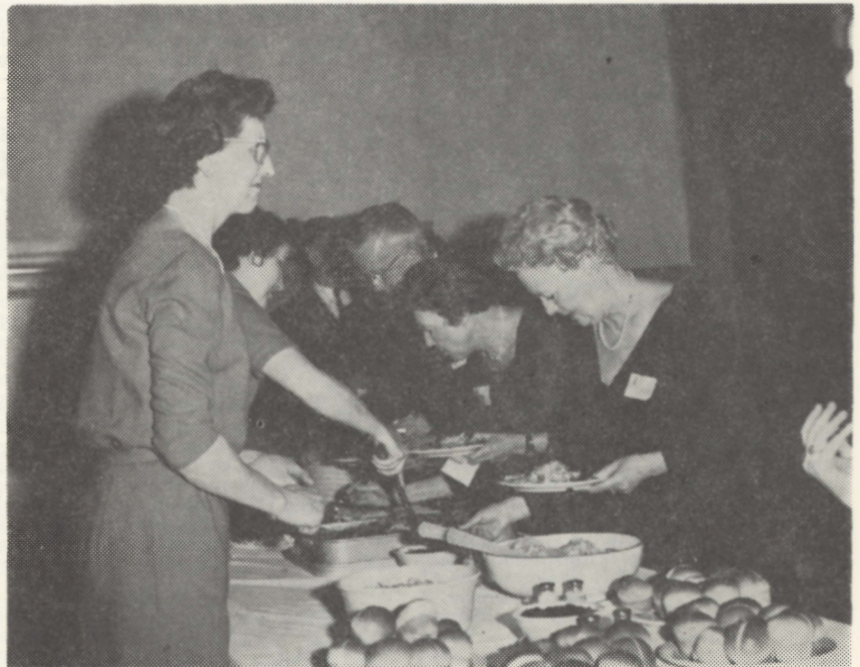
"Dinner is served" — Alumni Night at the Residence.