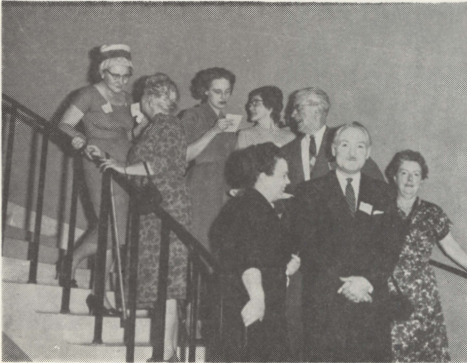
A group of alumni who visited the Men's Residence on March 8th are shown descending the main staircase (above).

For many years the lack of a permanent men's residence on campus has been a thorn in the pride of many loyal Dalhousians. Generations of students have been quick to lay the blame for everything from poor grades to a losing football team on the non-existent residence doorstep.