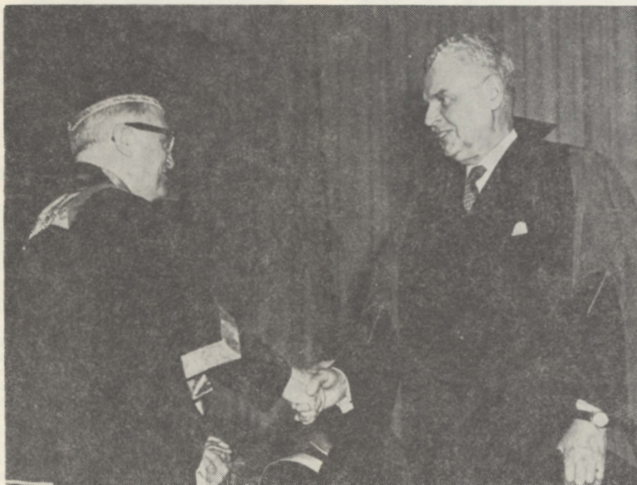
"I now ask you, Mr. President, in the name of the Senate, to confer on John George Diefenbaker the degree of Doctor of Laws, honoris causa."