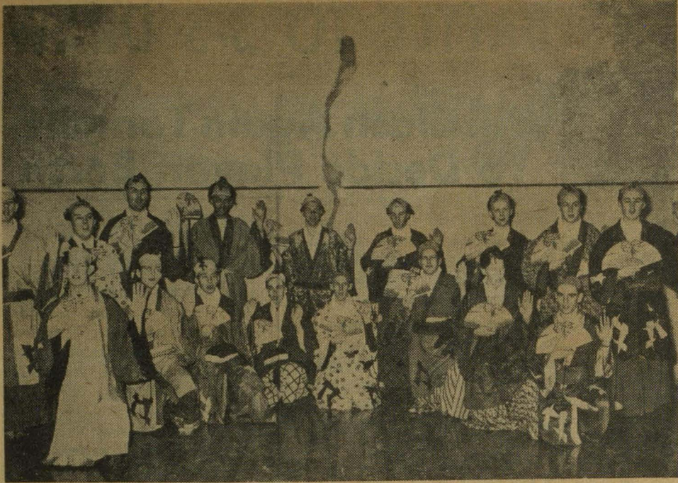
Twenty-Seven Lusty Voices —The Male Chorus for the Glee Club's presentation of "The Mikado" is shown above in one of the most colorful scenes in the whole operetta. The group above are but a small portion of the total number of people who are contributing their time, skill and energy to the success of this venture. The public performances of the operetta will be Thursday, Friday and Saturday, March 1, 2 and 3.