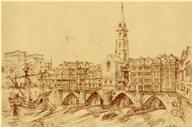
BRISTOL BRIDGE, ENGLAND, AND JOHN CABOT'S SHIP, THE MATHEW.