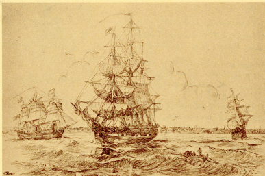
BRISTOL COUNTY, AMERICA, AND THE NEW BEDFORD WHALERS.