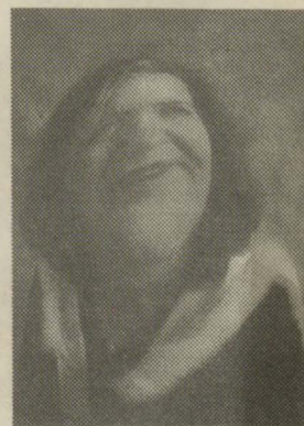
Computer enhanced photo. Won't Grandma be pleased?

Why settle for Jane Doe when you can have Marilyn Monroe?