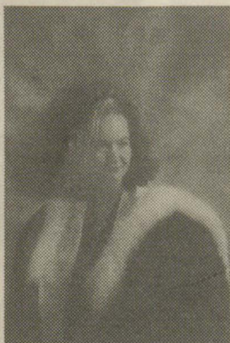
Computer enhanced photo. Head too big? No prob!

However, should this come to pass, Dal-Acadia games will certainly continue to be high in attendance and energy, not to mention in delicate artistic presentation.