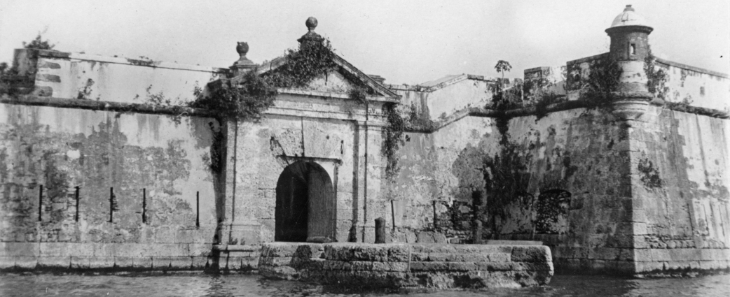
GATE OF SAN FERNANDO CASTLE-ENTRANCE OF THE HARBOR, CARTAGENA-COLOMBIA