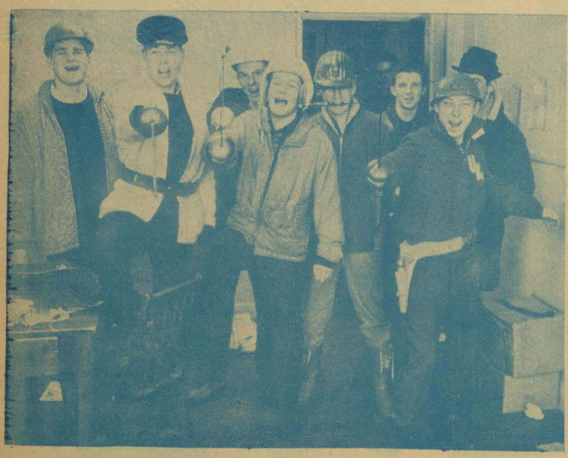
THE CONQUERING HEROS following the invasion. Their opposition, consisting of two frightened commissionaires, armed with BOMARCS, were quickly vanquished at sight of our heavily-armed troops.