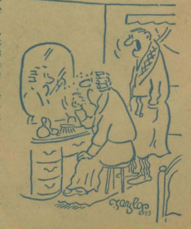
"The gun's in the middle