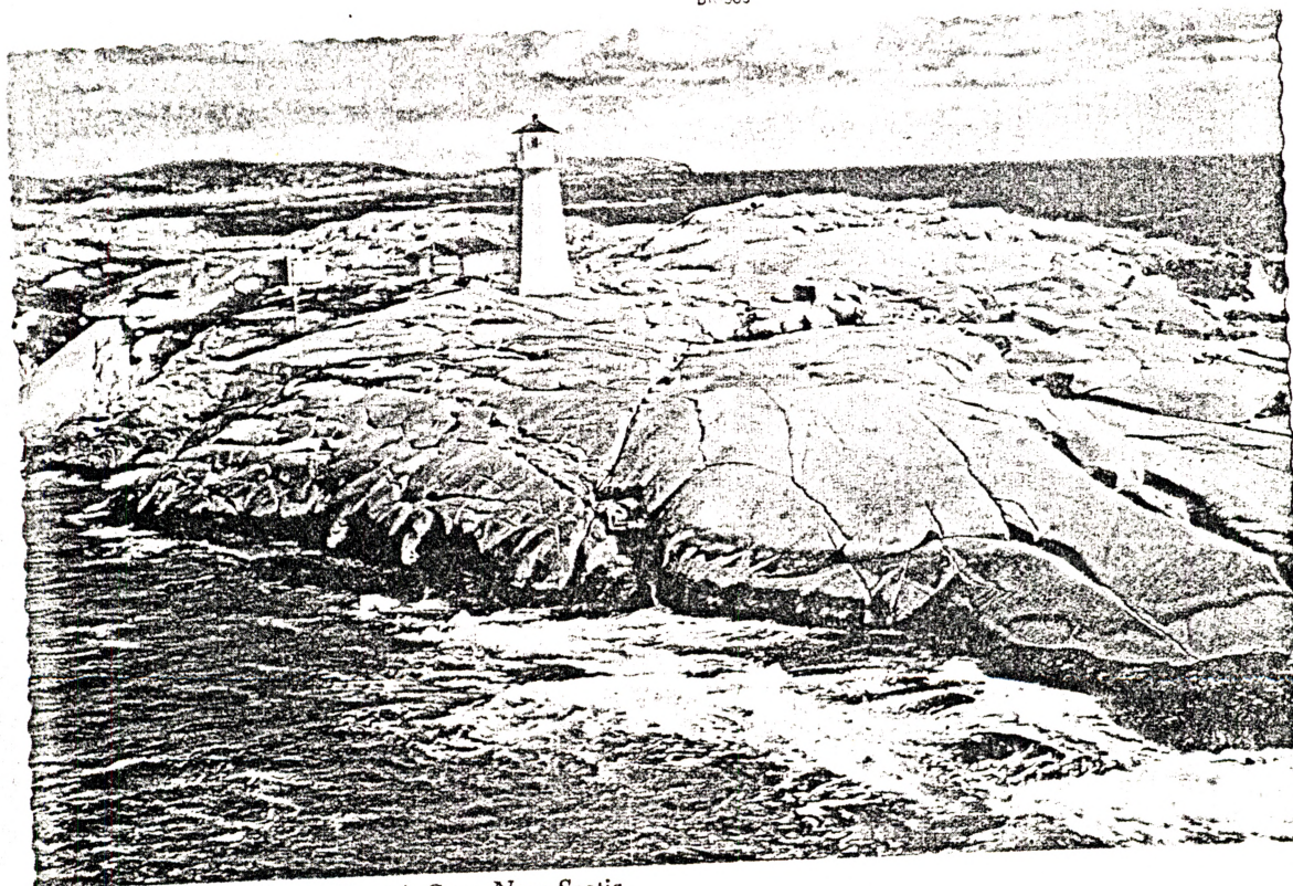
Air View, Lighthouse, Peggy's Cove, Nova Scotia