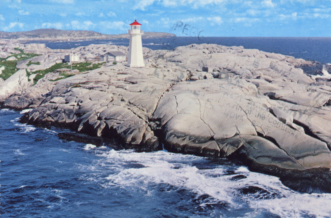
Air View, Lighthouse, Peggy's Cove, Nova Scotia