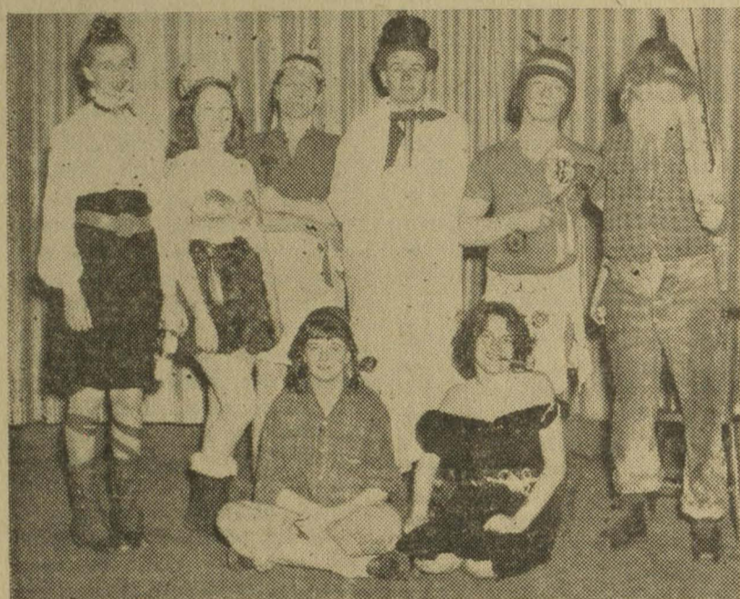
— A BIT OF DOGPATCH —