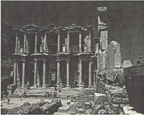
Ruins of The Temple of Artemis, Ephesus (Turkey)

Originally produced during the reign of Queen Elizabeth, Shakespeare's The Comedy of Errors is based primarily on source play The Menacechmi , written by Roman playwright Plautus. One of the major alterations Shakespeare made from his source was to set the play's action in Ephesus (modern-day Turkey), focusing on the town's reputation as a hotbed for witchcraft and sorcery.