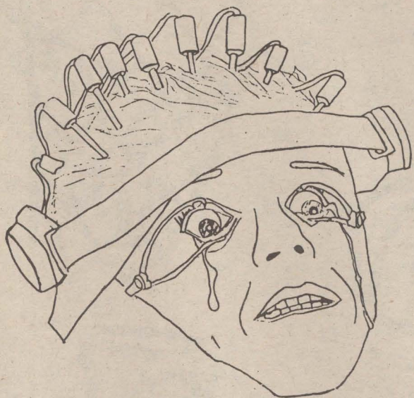
"We started in 1976, and 10 years have passed like Clockwork."