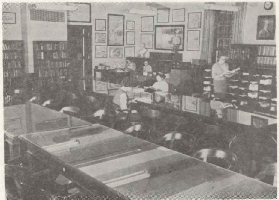
The New Humanities Reading Room with additional study facilities and open shelf collection