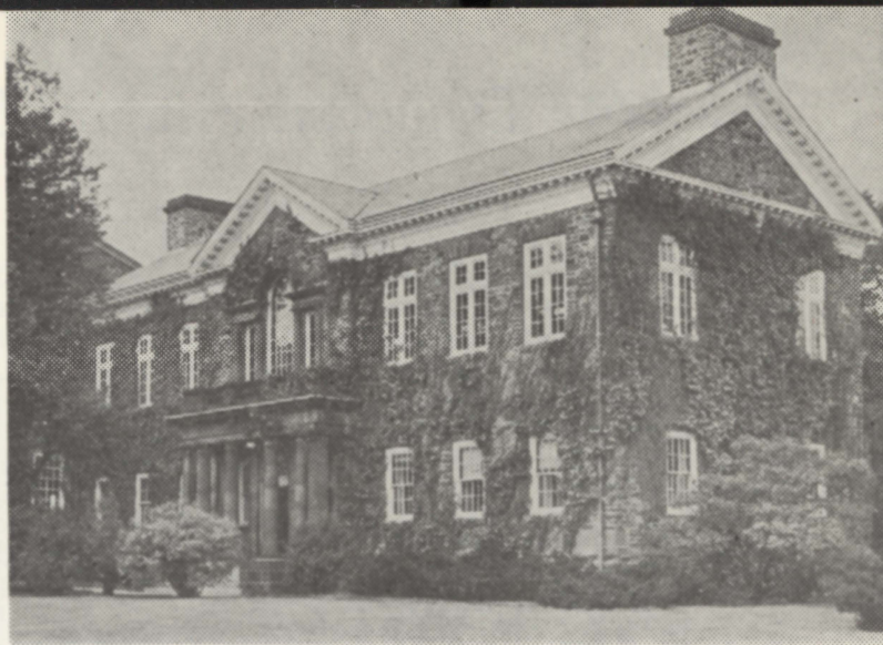
Dalhousie's Macdonald Memorial Library