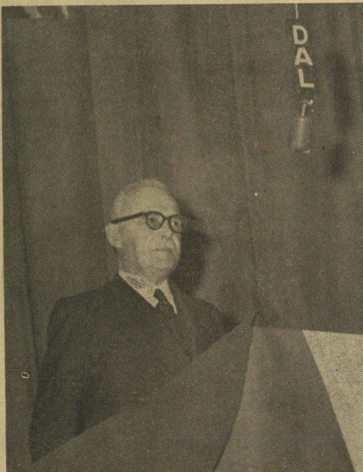
. . . Prime Minister St. Laurent