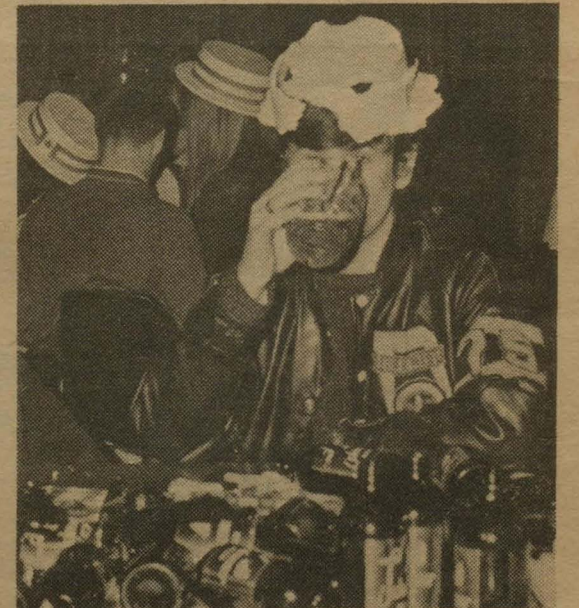
Why all the empty bottles ?