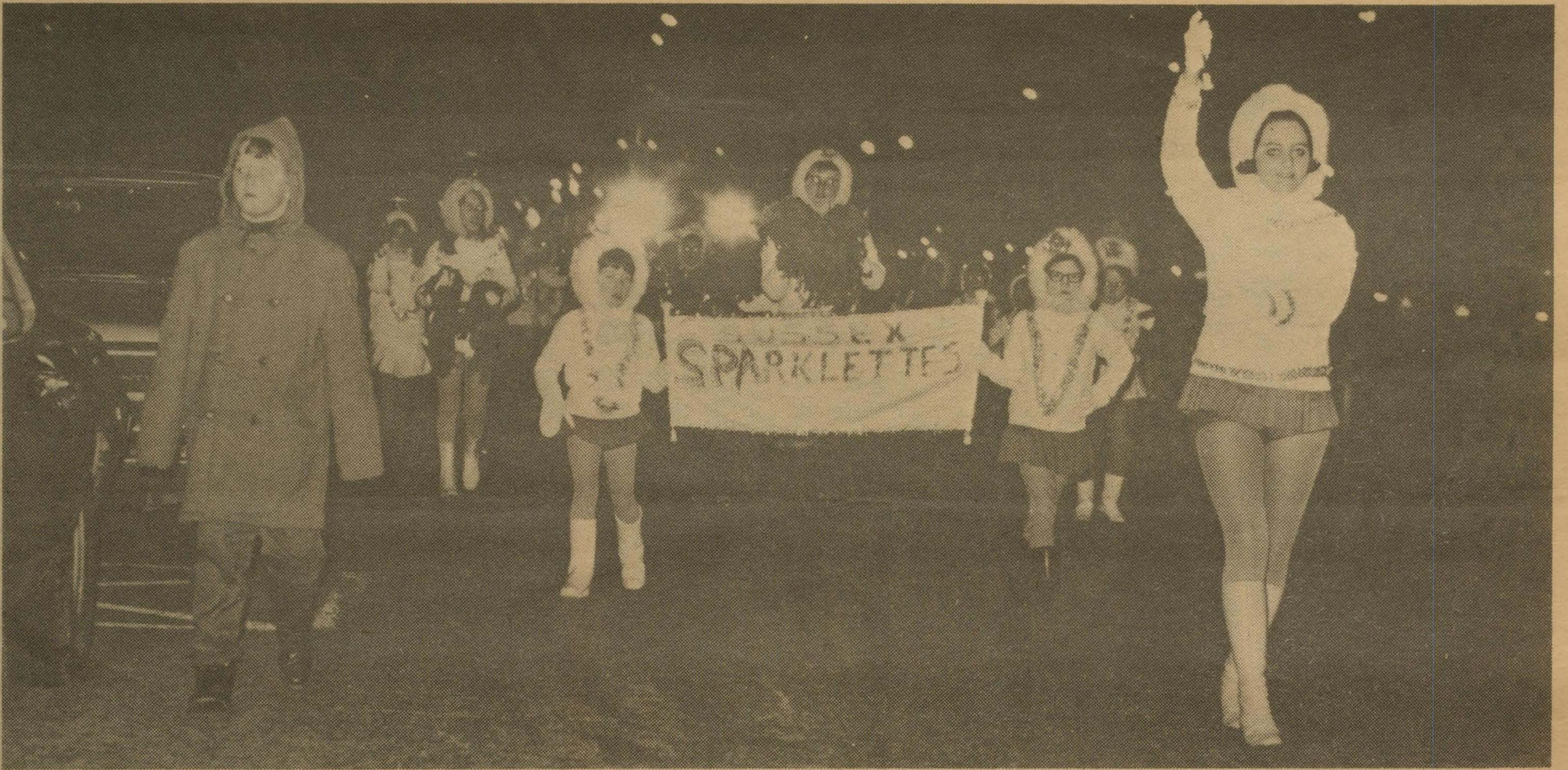
Why the Sussex Sparklettes ?