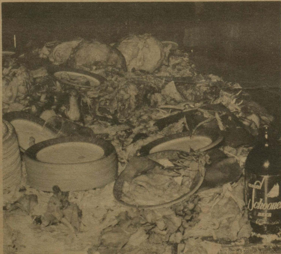
Why isn't this picture in color?