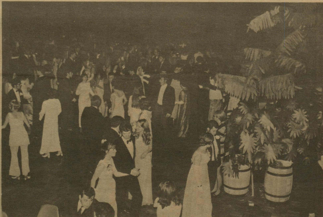
Why are all these people having such a good time?