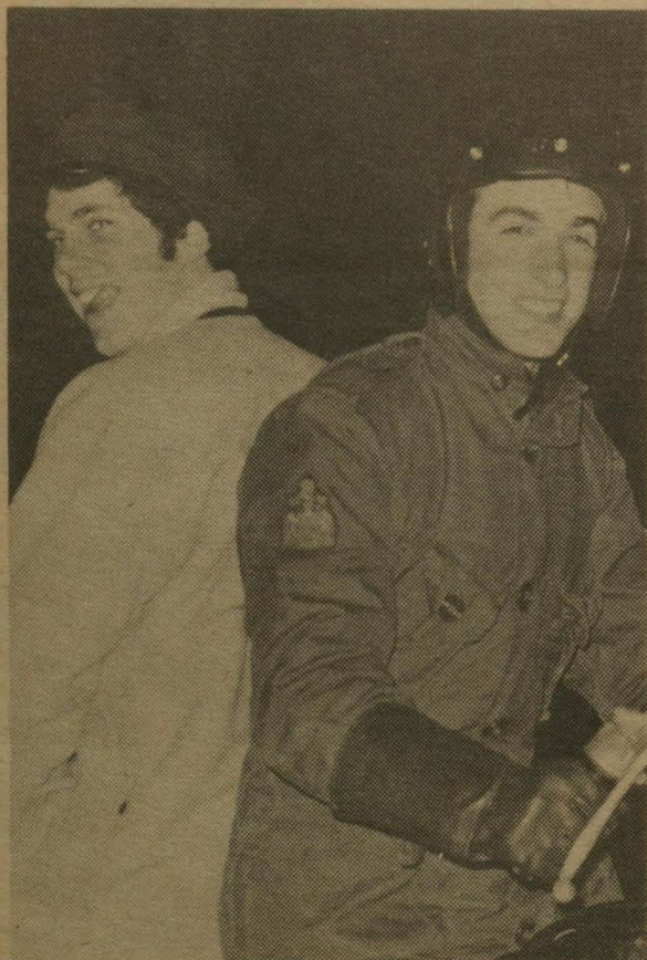
Why are these guys laughing?