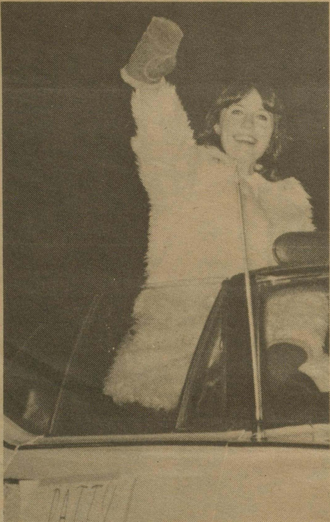
Why is this girl smiling?