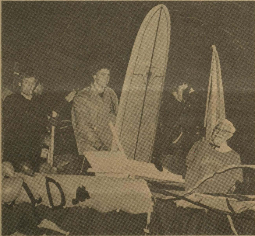
Why are they hiding the Colonel's white suit ?