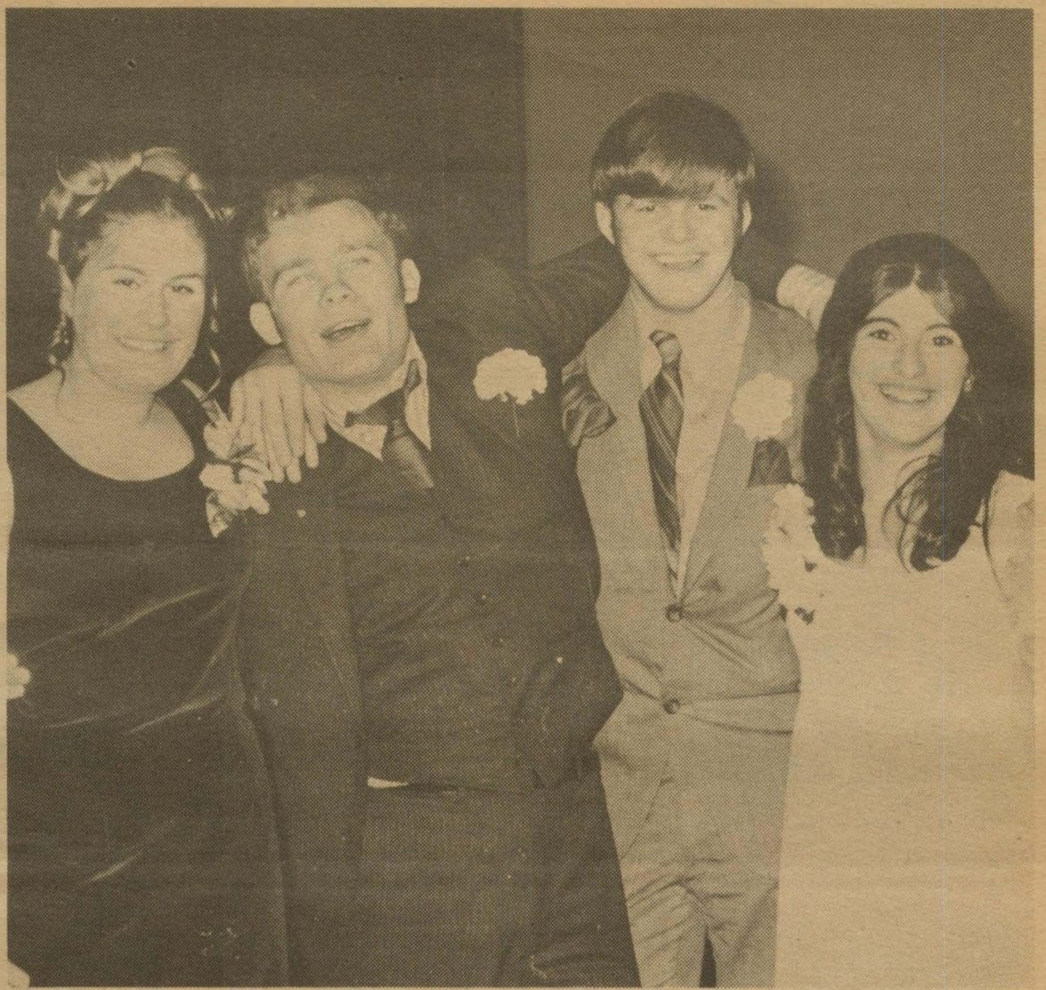
Why are these people grinning?