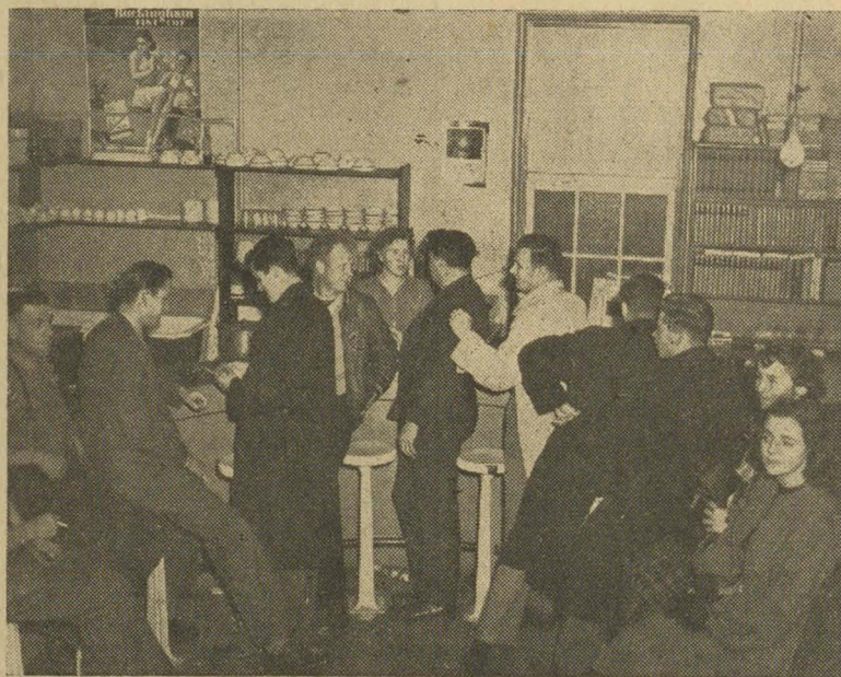
1700 Students Are Customers

The Glee Club wants tenors for its male chorus, particularly for the production of Patience next term. All interested are asked to report at Thursday night rehearsals in the Gym at seven-thirty p. m.