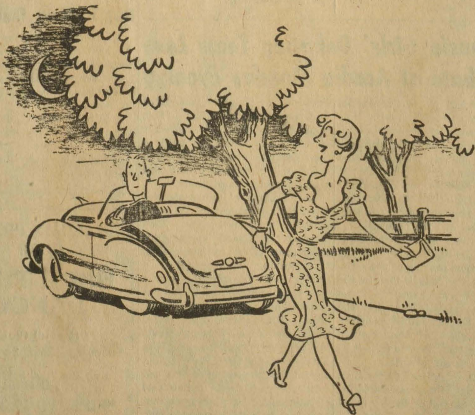
"I expected you to run out of gas but not out of Player's!"