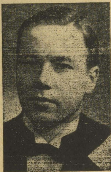
Pharos Editor —

It is to be hoped, said one spectator, that these dances will become a regular institution. They do a great deal to fill in the entertainment gap on the campus.