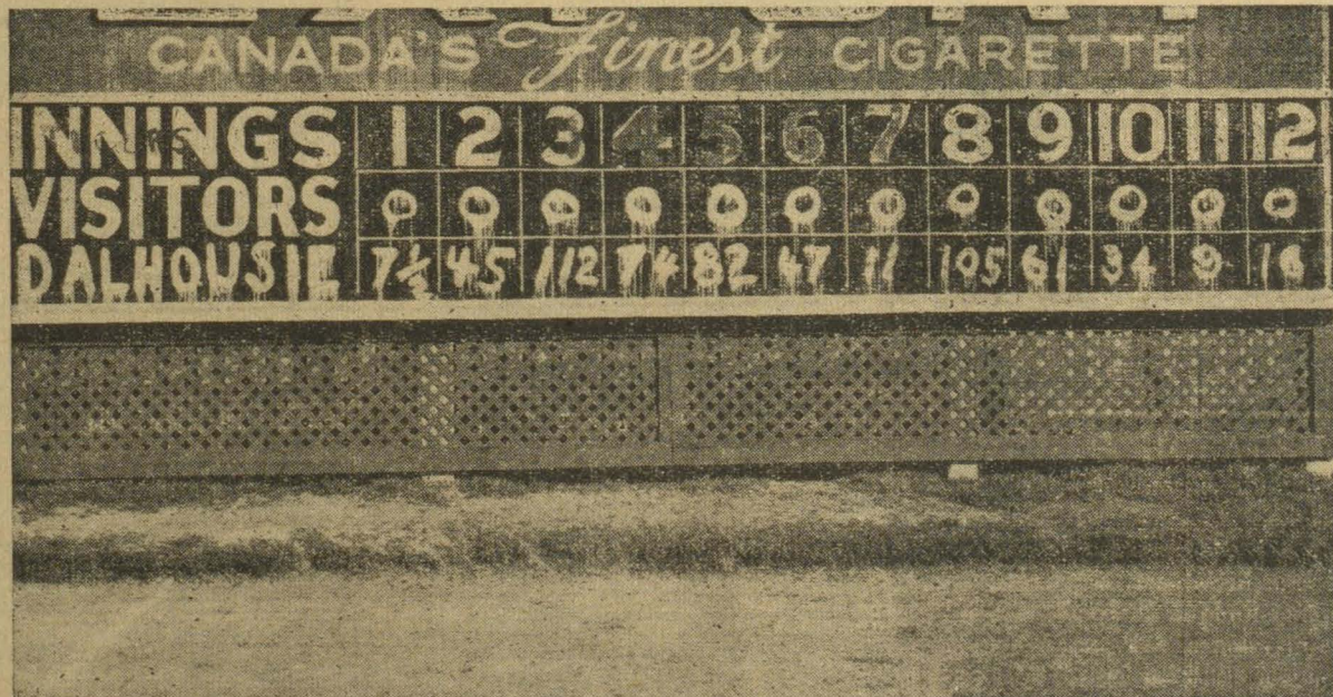
WHERE VANDALS SMEARED THE SCORE BOARD AND DALHOUSIE