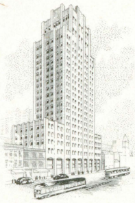
THE STAR BUILDING TORONTO CANADA