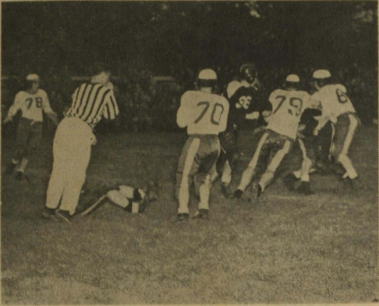
THE FLIERS MOVE IN as Dal carries the ball down the field. The game was marked by many such Dal rushes but the Shearwater team went on to win 25-17.