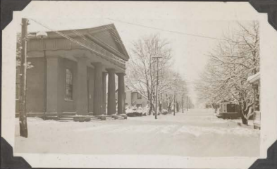
Courthouse, and Church Street looking north.