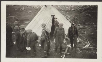
G Company, 2/W.N.S.Reg't. At Gull Islands Nov. 1, 1942.