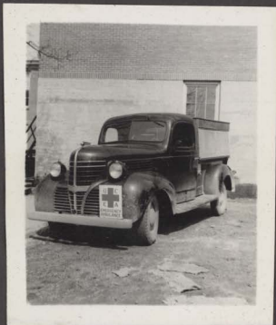
Emergency Ambulance Liverpool, 1941

EMERGENCY HOSPITAL FOR CREWS TORPEDOED OFF QUEENS COUNTY COAST.