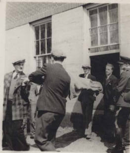
Evacuating frost-bitten sailors from Liverpool High School after treatment.