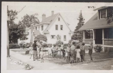
The Park Street kids hold a sidewalk bazaar for the Queens Fund. Aug. 24, 1944 297