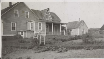
House of Ralph Cross, Tancook Island, where Tom stayed.