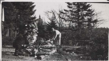
Parker chops kindling while Danlap swats flies on one of the trophies. 732