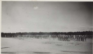
Afternoon parade. 366 West Nova Scotia Reg't.