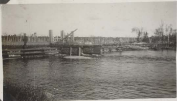
Tobeatic Dam, May, 1946.