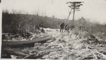
874 Breaking camp at Tupper Lake, May, 1946.