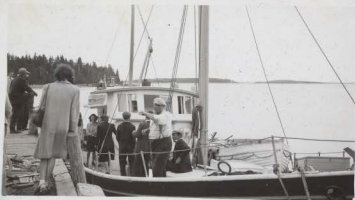
The ferry, "T.I. Service" at Government Wharf, Chester.