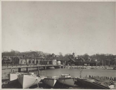
Liverpool and the Mersey River bridge, from the old shipyard, February, 1951