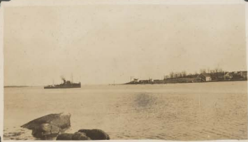
Naval patrol craft entering Liverpool harbor, November 1945. 831