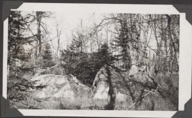
Tom's lookout 815