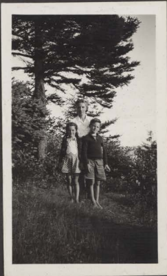
913 994 At Summerville July 1943