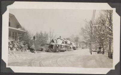
Looking down Park Street, Raddall house centre.