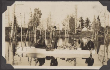
Setting out for Big Falls with the first consignment. 746