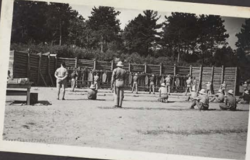
761 Reising carbine shoot.