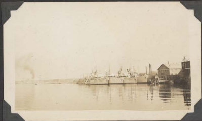
Corvettes tied up at Thompson's plant for refit. November 1945. 834