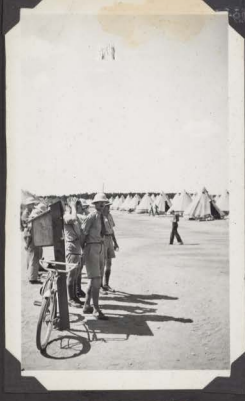
Col. C.A. Good ("Aunt Good")