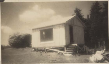
1037 Moose Harbor cabin, summer 1954. 1038