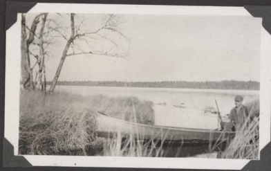
Tom. Going up from Eagle to Long Lake 816