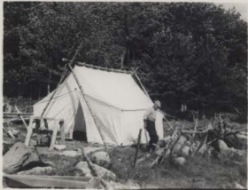
The tent at Blind Lake, with Rae Dauphinee, forest ranger. 1021

Journey to St. Croix Lake & river September 1952.