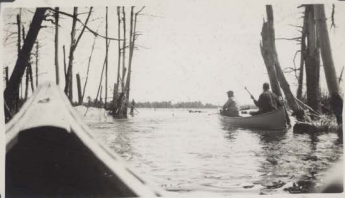
Fishing at mouth of Little Tobeatic Brook, May, 1946.