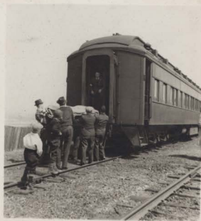
Survivors S/S Empire Seal being entrained for Halifax after treatment in Liverpool Emergency Hospital