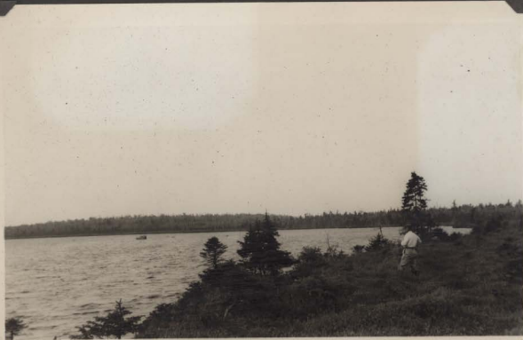
Mud Lake, the source of West Brook, No. 2