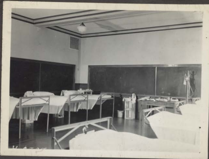
One of the wards 717 Liverpool High School.