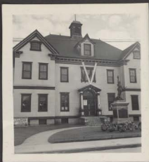
Town Hall, Liverpool Armistice Day, 1941