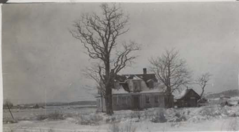
February, 1946 860 Old Macleod house, Shipyard Point.