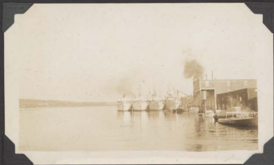
Corvettes at Thompson's plant, November 1945. Nickerson's fish plant at right. Note small number of fishing boats. 834a