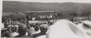
Jock Macdonald 904 conducts a Gaelic chorus