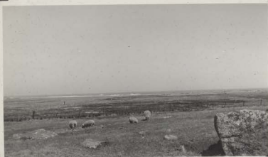
East Side. 946 Seal Island.