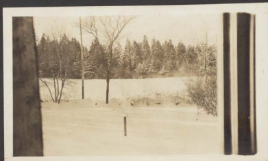
802 From my den window February 1945