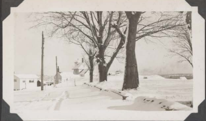
Fort Point 843