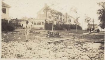
Seaborne's lawn, Fort Point. after a storm, 1940. T.H.R. in foreground.