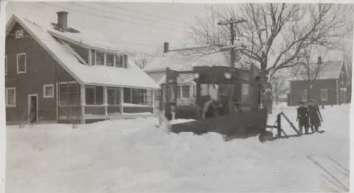
February, 1946 snow plough on Park Street 858