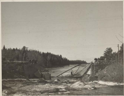
Collapse of Broad River bridge, February, 1951