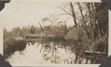
Outlet of Eagle Lake, from the old wing dam.