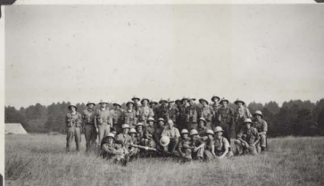
Lewis Gun class. G Company.