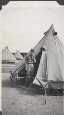
Doc. Wickwire 160