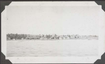
Summer bungalows, Hunt's Point