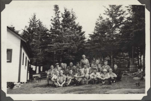
South Shore officers, 2nd Batt. West Nova Scotia Reg't. Round Bay, N.S. July 1942