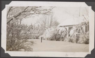
Outside Tom's study.