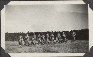
Some of the G Company boys