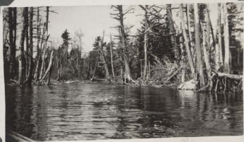
Mouth of Little Tobeatic Brook, May '46.