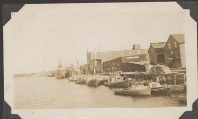
Naval craft decreasing, fishing boats increasing fast, November 1945. 835