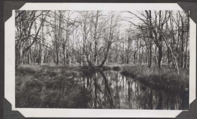
Looking down from the beaver dam. Foot of Long Lake. 817