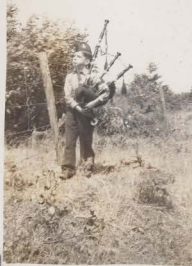
1946 The smallest competitor