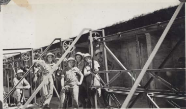
G Co'y boys in the butts