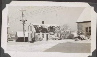
The old Dexter Tavern at Fort Point, built 1767.