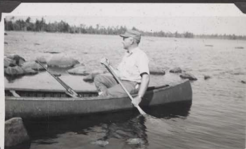
Deer hunting at Eagle Lake October, 1946. 923-924