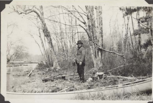
Irving Bain, below the "tow bridge, Shelburne River.