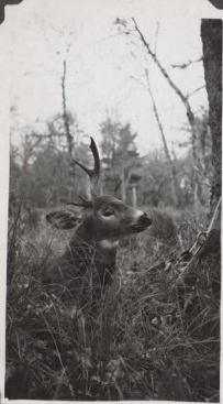
Tom's buck 835