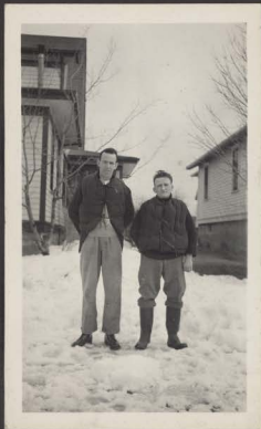
Bosun and "Chips" S/S Empire Sun