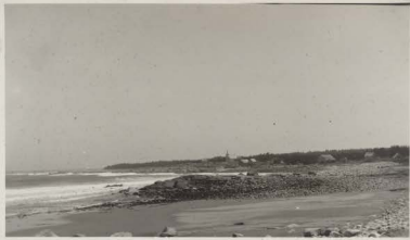
East Cove and Brig Rock, Seal Island. 947