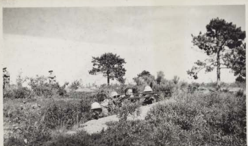
Field tactics. 74 Some of G Co'y. boys.