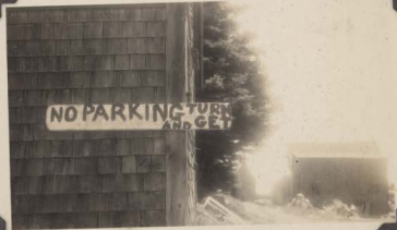
Fishermen's "No Parking" sign. 1039