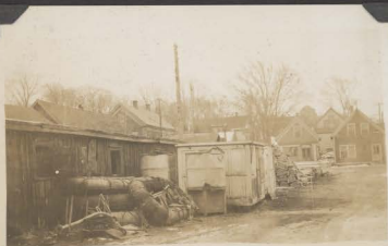
A corner of "Little Burgeo", Liverpool waterfront, November 1945. Abandoned life rafts, davits, crow's-nests, Asdic cabins, etc. 839