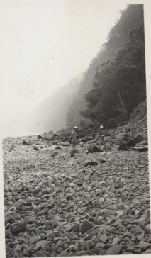
At Amethyst Cove.