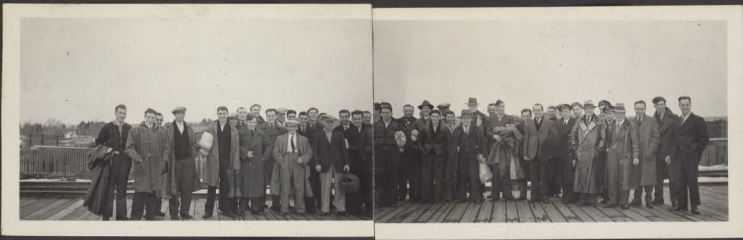
Crew, S/S Empire Sun, torpedoed off Liverpool Feb. 6, 1942 728