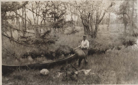
West Brook, edge of Dunraven Bog. Here we tented for the night, and walked up to Mud Lake in the morning.