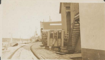
Liverpool waterfront, November 1945. 838 Note abandoned 4-inch gun, from a corvette.