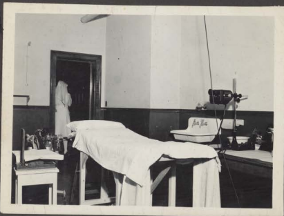
Operating Room in 720 Liverpool High School