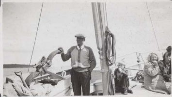
Aboard the "T.I. Service". Ox-yoke amongst the freight.