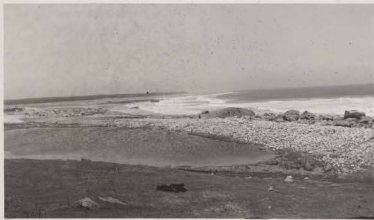
Brig Rock Pond and east beach. 949