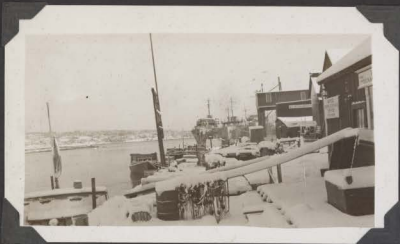
Waterfront after a storm 842