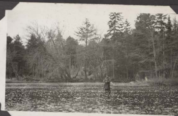
Irving Bain, rangers' camp in rear. Shelburne River.