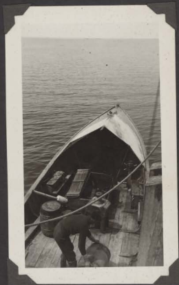
165 Loading bait etc. for Seal Island.