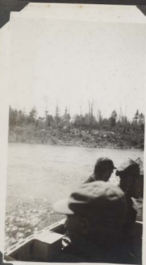
Leaving rangers' camp, Tobestic. May, 1946