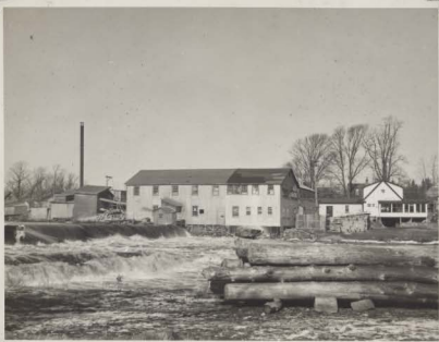
Milton dam and woodworking mill, February, 1951