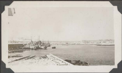
Looking up-river from the yacht club 841