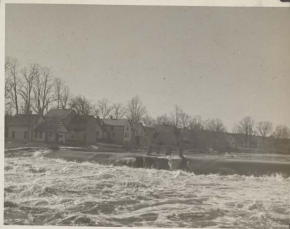
Milton lower falls March 1951