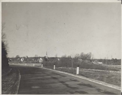
The West road to Milton, February 1951