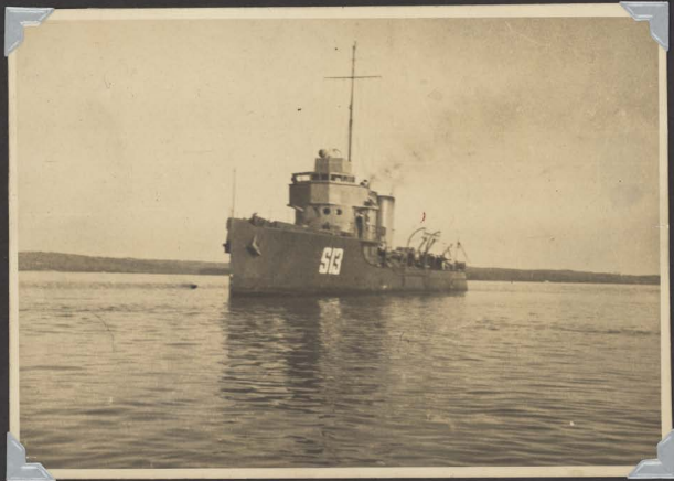
HMCS "Renard" (armed yacht) at Liverpool, N.S. 1942