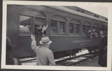
331 Crew S/S Empire Sun leaving Liverpool