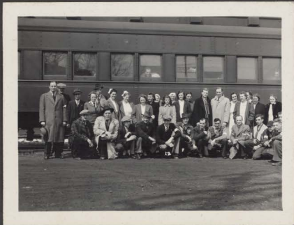
Liverpool Emergency Staff. (survivors "Empire Seal" in Pullman berths behind) Feb. 1942