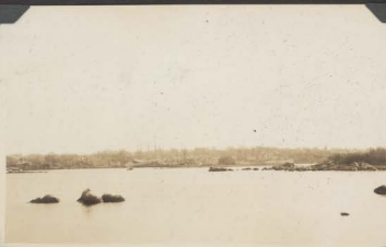
Thompson's from across the river, Nov. 1945. Several corvettes and frigates at wharf. French schooner on the slip. 840