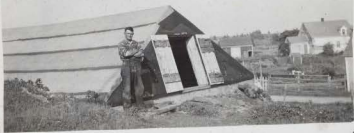
Ralph Cross stands beside his cabbage cellar. 919