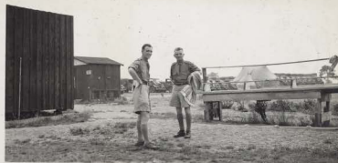
Yarmouth officers.