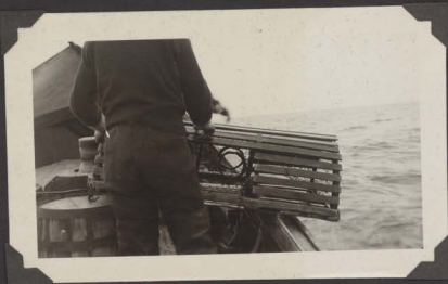
Hauling a lobster trap 164