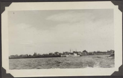
163 Leaving Clark's Harbor.