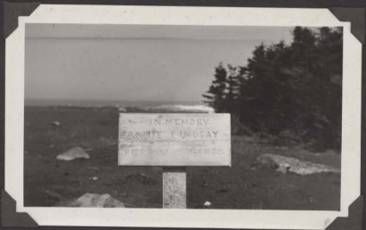
Grave marker outside the church, East Side, Seal Island.