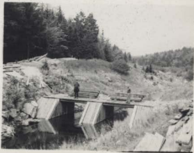
Sluice of canal from St. Margaret's Bay Lake to St. Croix Lake. 1023