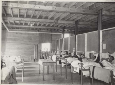
Survivors, S/S Empire Seal in basement ward of Liverpool High School Feb. 19, 1942 721