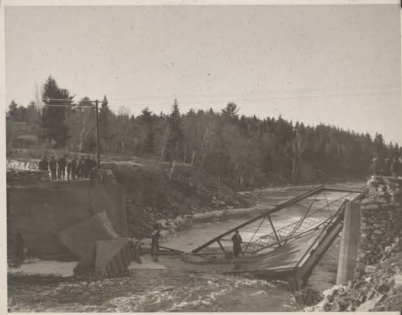
The wreck of the Broad River bridge, February, 1951. It collapsed under the truck at bottom left.