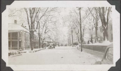
Main Street, looking east from out side Mersey Hotel.