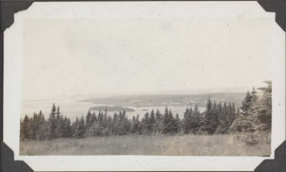
210 Baddeck, from Beinn Breagh