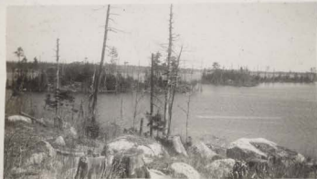
Tobeatic Lake, May, 1946 Looking down from rangers' cabin.