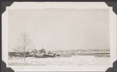
Corvettes (sold to private buyers) at Thompson's. Liverpool, December 1945. 844