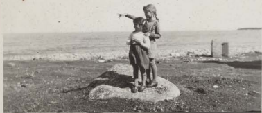
Two of Dewey's grandchildren. 948