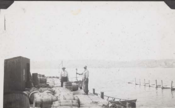
The wharf at South-East Cove, Big Tancook Island.