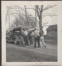
125 First Aid Crew Loading a "casualty"