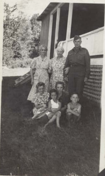
744 Family group. Summerville. Aug. '42