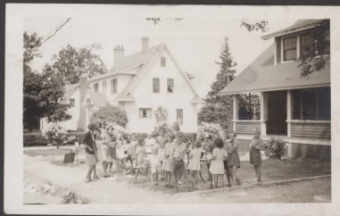
The proceeds were $18.50 300